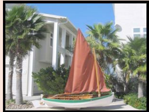
12' Whitehall Wooden Sailboat Featured Auction Item

RSVP to 361-749-7300 or portamuseum@centurytel.net Tickets/Tables can be bought at www.portaransasmuseum.org