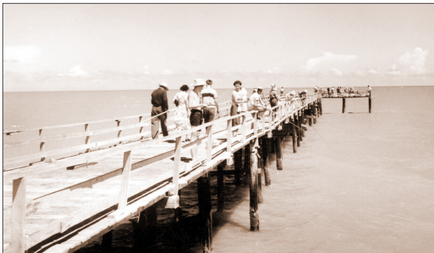
South Pier 1951

First Friday is held from 5:30 to 7:30 p.m. at the Art Center.